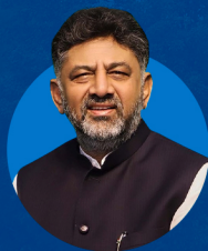
Shri. D. K. Shivakumar (Chairman, Deputy Chief Minister of Karnataka)

Bachelor of Physiotherapy | Diploma in Pharmacy